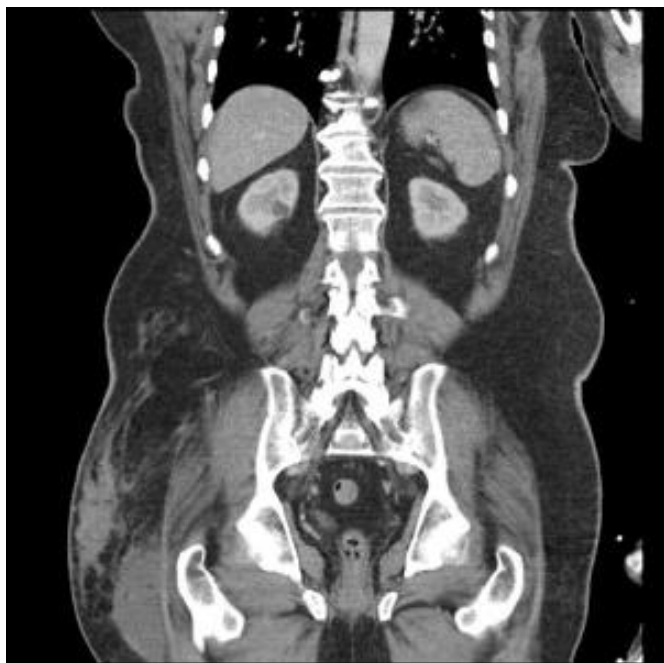
Photo 2: MRI of the patient who sustained the traumatic injury resulted in Large Morel-Lavallee lesion of the right hip.